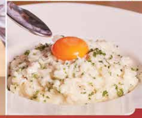
Mountain Risotto One of hundred best dishes recipes in the world selected by Asia Guide